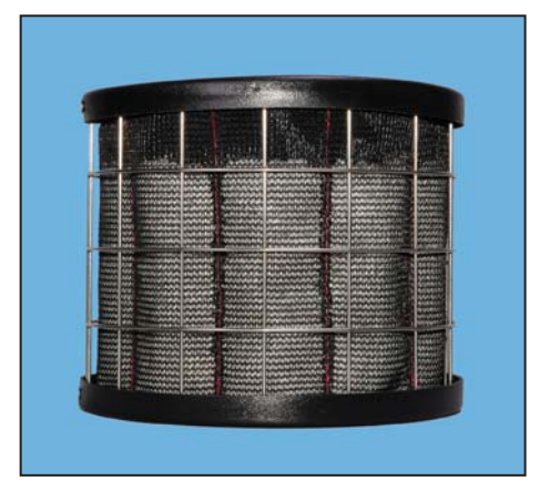
TRITON MEDIA CARTRIDGE